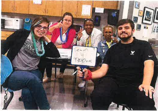
GENERATIONAL JEOPARDY WINNING TEAM